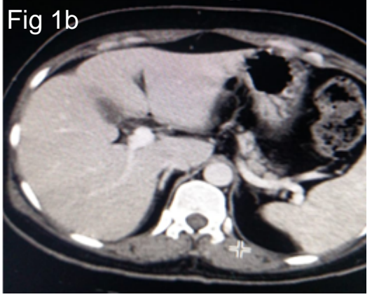
Fig: I a & b: CT scan abdomen showing accessory liver lobe as nodular structure