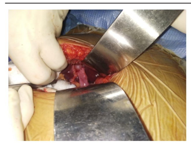
Fig II: Peroperative finding of liver nodule on surface of gall bladder

asymptomatic with incidental finding during surgery or at autopsy. Patients usually present with recurrent abdominal pain with deranged liver functions.4 Usually it is infra-hepatic in position. 5,6 Accessory liver lobe on the basis of common capsule and biliary drainage are of three types: Type1 is accessory lobe duct draining into intrahepatic bile duct of normal liver, Type 2 the accessory lobe duct draining into extra hepatic bile duct of normal liver and Type 3 is accessory lobe, common capsule with normal liver, with bile duct of accessory lobe draining into extra hepatic duct.7 It may present as severe pain due to pedicle torsion, bleeding, or suspected as a liver tumor.8,9 Preoperative diagnosis is difficult but ultrasound abdomen, MRI, and CT scan may help in suspecting them.<sup>2,10</sup> Laparoscopic surgery is ideal for the diagnosis as well as treating the lesion. 11 Our patient had gall stones as well thus during surgery the lesion was removed with gall bladder and histopathology confirmed it as a structure resembling liver.