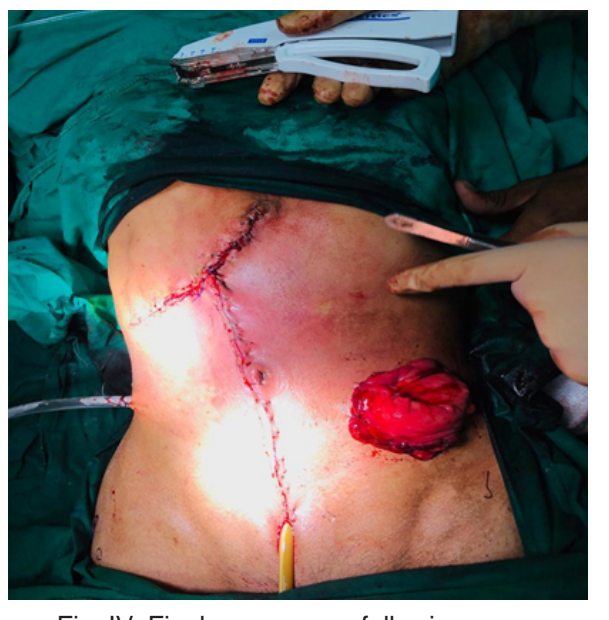
Fig IV: Final appearance following surgery.