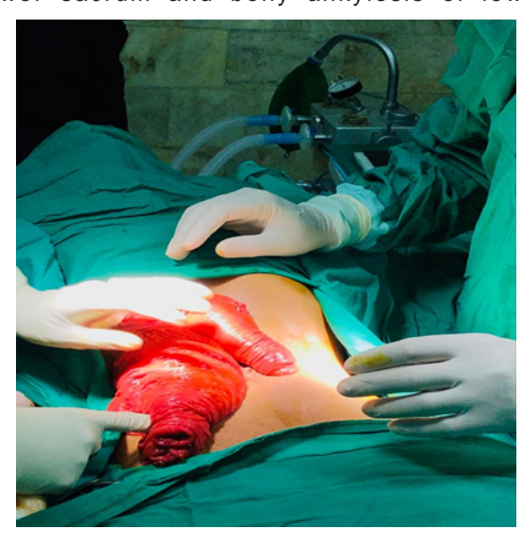
Fig I: Prolapse bowel loops from anterior abdominal wall defect.

micturition for 2 weeks. He had a history of gut coming out from an anterior abdominal wall defect and imperforate anus since birth. He had normal vaginal delivery at home conducted by traditional birth attendant. Later on he was checked by a local physician of his village who advised surgery, but they did not seek medical attention due to lack of awareness, resources and fear of death. On examination, the gut herniated through upper abdominal wall defect and abdomen was tender at suprapubic region (Fig I). He underwent CT scan abdomen that demonstrated a large anterior abdominal wall defect with herniation of small bowel loops, mesentry and mesentric vessels without covering suggesting gastroschisis (Fig IIA). Rectum showed abrupt cut off at upper sacral level representing high anal atresia. There was absence of coccyx, partial agenesis of lower sacrum and bony ankylosis of lower