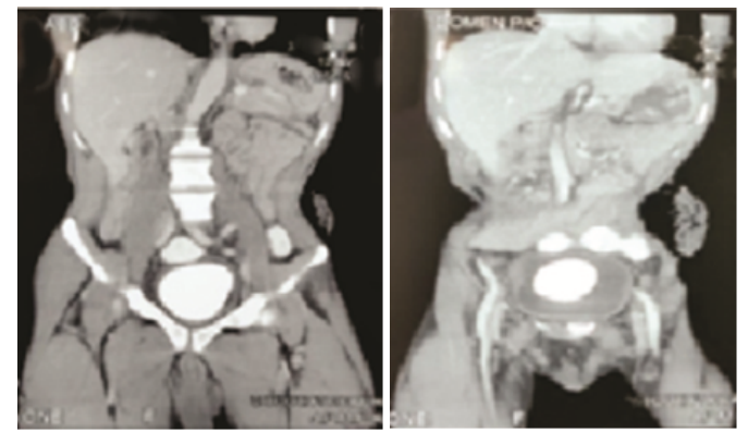
Fig-I B: CT scan showing the urinary calculus

lumbar and upper sacral vertebrae with spina bifida at lower lumbar levels. Left kidney was not visualised, likely congenitally absent. All these findings were consistent with VACTERL association. A urinary bladder calculus was also seen (Fig II B).