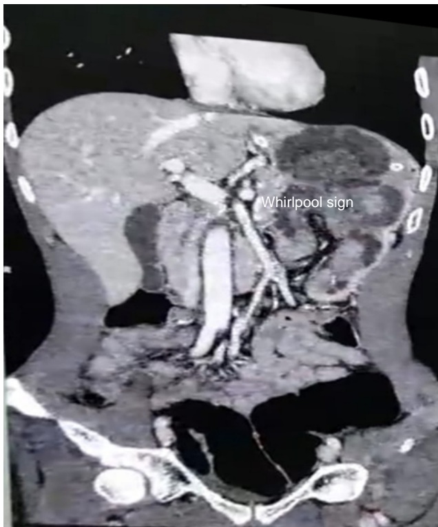
Fig. I: Whirlpool sign indicative of intussusception.