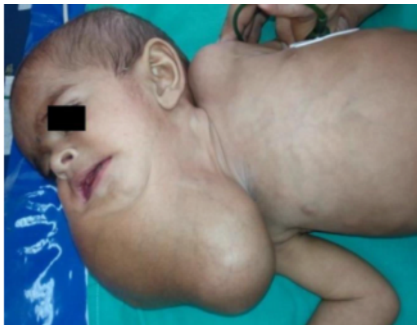
Fig IV: Infant with right lateral neck mass

consistency of mass. Patient had no breathing and swallowing difficulties. With time lesion persisted without any significant change in size. A decision of surgical removal was therefore made. Examination under anesthesia revealed some mobility of the mass and diagnosis of teratoma was made. Surgical excision was not difficult as mass pushed the surrounding structures outwards without invading them. Gross examination of the cut section of the mass showed multinodular cystic mass. Tumor markers (beta-HCG and alpha protein) sent after surgery, were within normal range. CT scan neck done earlier was reviewed in retrospect. It showed mass measuring 10cm x 8cm, consisting of mixed solid and cystic components with focal calcifications which were not taken into consideration earlier.