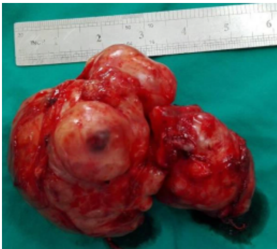
Fig III: Completely excised tumor