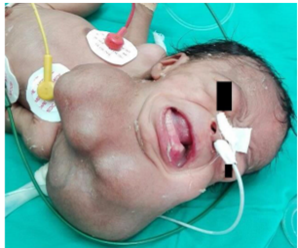
Fig I: Newborn with large neck mass

An 11-month-old girl was admitted with huge cystic swelling on right lateral side of neck extending up to anterior aspect. This mass was present at birth. Initial diagnosis in neonatal period was cystic hygroma because of cystic feel with positive transillumination test (Fig-IV). Patient received two doses of intralesional betamethasone resulting in solid